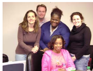
GMAT TURBOPREP GROUP ATLANTA