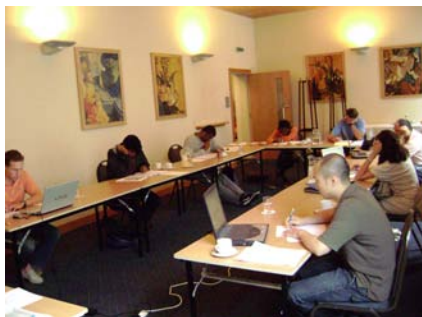
TURBOPREP® CLASS IN LONDON

You can also register by calling us at +1 212 682 5000 / +44 (0) 208 123 5060, or toll-free at 1 888 565 GMAT (USA/ CANADA only)