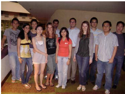
GMAT TURBOPREP CLASS IN SINGAPORE

Be informed and be smart -- Choose MLIC GMAT prep courses that offer full-time MBA instructors, and proactively coaches you in GMAT-critical areas, and backs up its training with industry-leading GMAT Score Guarantee™ MLIC trains more people per month in the major markets than any other company -- Kaplan, Princeton Review, Manhattan GMAT, Veritas Prep, Testmasters, and others.